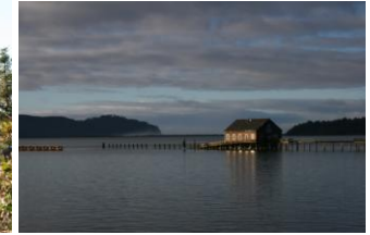
Old Coast Guard Boathouse