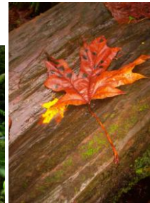
The Color of Fall