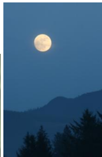
Full Moon Portrait