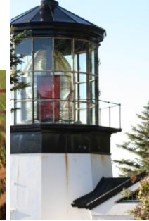
Cape Mears Lighthouse