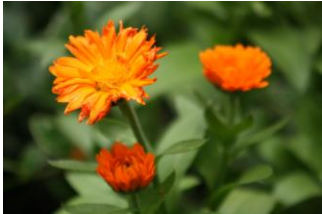
Burst of Color